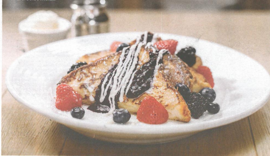
> GOOD MORNING (Clockwise from top) White brioche French toast at the Pantry; Bloody Mary insanity at Guy Fieri's; classic chicken and waffles at Della's Kitchen.